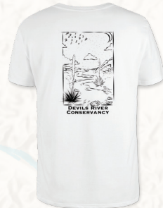
EXCLUSIVE WILD DEVILS 2021 T-SHIRTS AVAILABLE FOR PURCHASE!