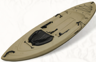
DIABLO PADDLESPORTS AMIGO KAYAK