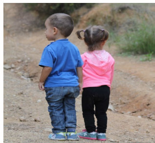
This is your last chance! Where will you run away for your Valentine's Day weekend. Find ideas at ozona.com. Reached 59,774 people