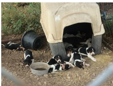
Dog days of summer have begun! It's ruff.....but if you are looking for a place to lounge, Ozona makes a great stop! Reached 32, 131 people