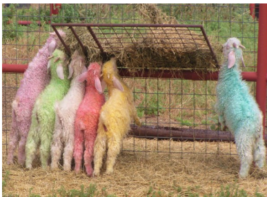
Are your taste buds looking for something different? Dining in Ozona offers a rainbow of variety! (goats were dyed rainbow colors) Reached 31,388 people