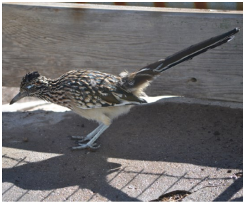
Has the holiday hubbub left you cuckoo? Get off the road, slow down and enjoy the local attractions in Ozona. Reached 86,442 people

We would like to thank those of you who have responded to our request for photos in Ozona and Crockett County. The Chamber is trying to expand it's photo library that we use on our web site, our Facebook page and in advertising in an effort to market and bring business to Ozona. We also use cute generic photos as well. Below are some examples we marketed to Houston, San Antonio, Austin, Dallas, and El Paso via our Facebook page, encouraging travelers to stop in Ozona on their way to their destination. To give you some idea of what we are looking for, following are pictures with captions we have used on the Chamber Facebook page, the number of times each post was liked and shared, and the number of people reached.