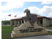
Ozona Chamber of Commerce @OzonaChamber Biz