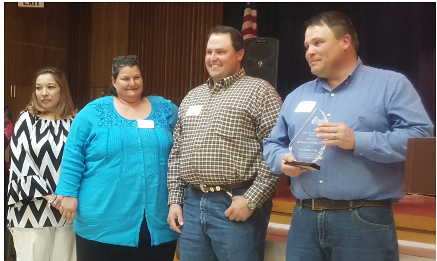
The General Stores accepts the 2015 Business of the Year Award