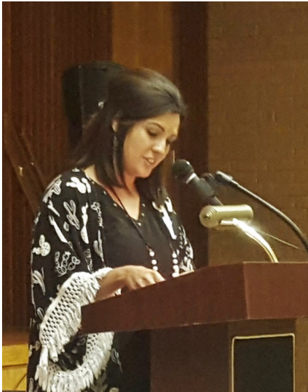
Chairman welcomes guests