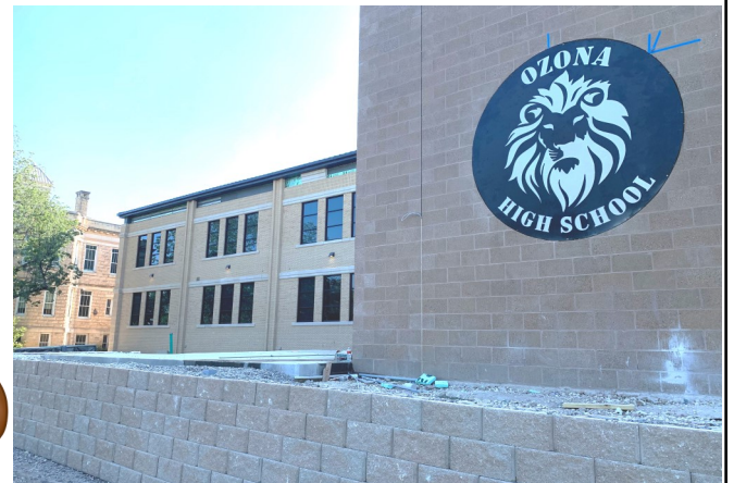
Finishing touches are being made to the Ozona High School campus in preparation for the new school year. These improvements are a wonderful asset to our community and will enhance the entire learning experience. The Ozona Chamber wishes all the students and staff an outstanding year! Every Step Lion Pride!