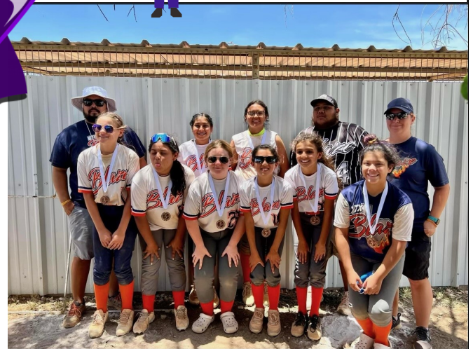
This WTX Blaze team was proud of their season finish at the softball tournament! Sporting events like these have a positive economic impact to the community, which is great for Ozona businesses! Congratulations to all those who participated in the 2022 season!