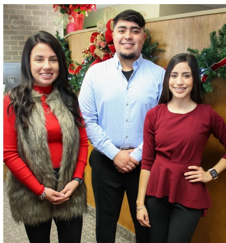
The Ozona Bank Drive-Thru team is all smiles at being selected Business of the Month

and dedication. We believe the achievement of goals depends on a community of people working together.