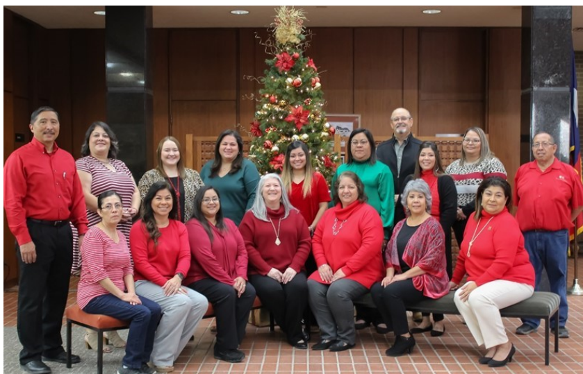
The Ozona Bank lobby team looks forward to serving you!

Ozona Bank is special! Sure, we have been around for more than 116 years, and we serve customers who live in both rural and urban areas, but what makes us different is that we stay in touch—with our communities and our customers! We are proud to support the Ozona Chamber of Commerce, various non-profits in the area and our valuable customers. We are committed to giving back to the community, not only with financial support and sponsorships but also with our physical presence