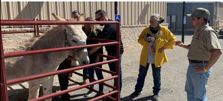
Peaceful Valley Donkey Rescue representative explains about their adoption program.