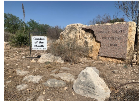
The Crockett County Interpretive Trail was chosen as the Garden of the Month by the Ozona Garden Club!