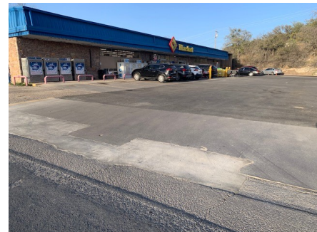
Lowe's Market is proud to show off their new parking lot paving! Have you been by to see it yet?

1002 Ave. E P.O. Box 4103 Phone: 325-226-6230 raelee.capry17@gmail.com