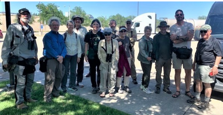
The Fieldguide Birding Tours from Austin stopped by the Visitor Center to take advantage of our clean restrooms on their way to the Big Bend! The tour makes Ozona a stop each time they pass through!