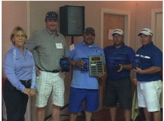
Rathole Drilling, Inc. of Big Lake takes the 3rd Bi-Annual Pump Jack Golf Open First Prize Award.