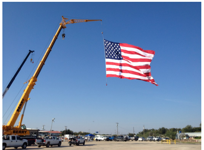
Bay Ltd-The Berry Company exhibits a crane with 40 x 80' flag